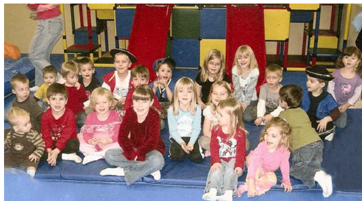
Our Preschoolers enjoyed a day at Hop Scotch.