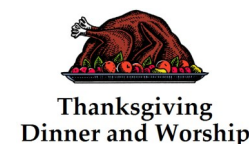
Thanksgiving Dinner and Worship

Thanksgiving dinner with the Woodburn Baptist Church family will be a potluck supper. The Woodburn Campus will meet at South Warren High School on Sunday, November 13 at 5:00 pm.